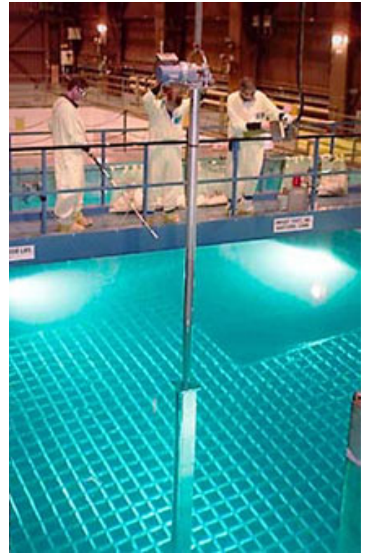
Figure 2. Fuel being moved in a spent fuel pool.

When the operating licenses for the Brunswick reactors were originally issued in the 1970s, the expectation was that spent fuel would remain in the spent fuel pools for only a few months before being shipped away for either reprocessing or disposal. Each spent fuel pool only had storage capacity for 720 fuel assemblies, or enough for an entire reactor core of 560 fuel assemblies plus 160 spent fuel assemblies. The primary concern at that point was moving the fuel, rather than storing it. As a result, the only accident involving spent fuel described in the FSAR was a fuel-handling accident – spent fuel dropped onto other spent fuel or damaged by striking something while being moved. And therefore the Technical Specifications only contained requirements to protect workers and the public from radioactivity released during a fuel-handling accident. The document dismissed other potential scenarios leading to damage of spent fuel in the pools, like loss of water or cooling capability. The rationale was that small amounts of spent fuel were intended to be stored in the pool for small amounts of time.